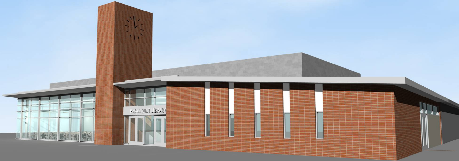
Perspective View of North Elevation