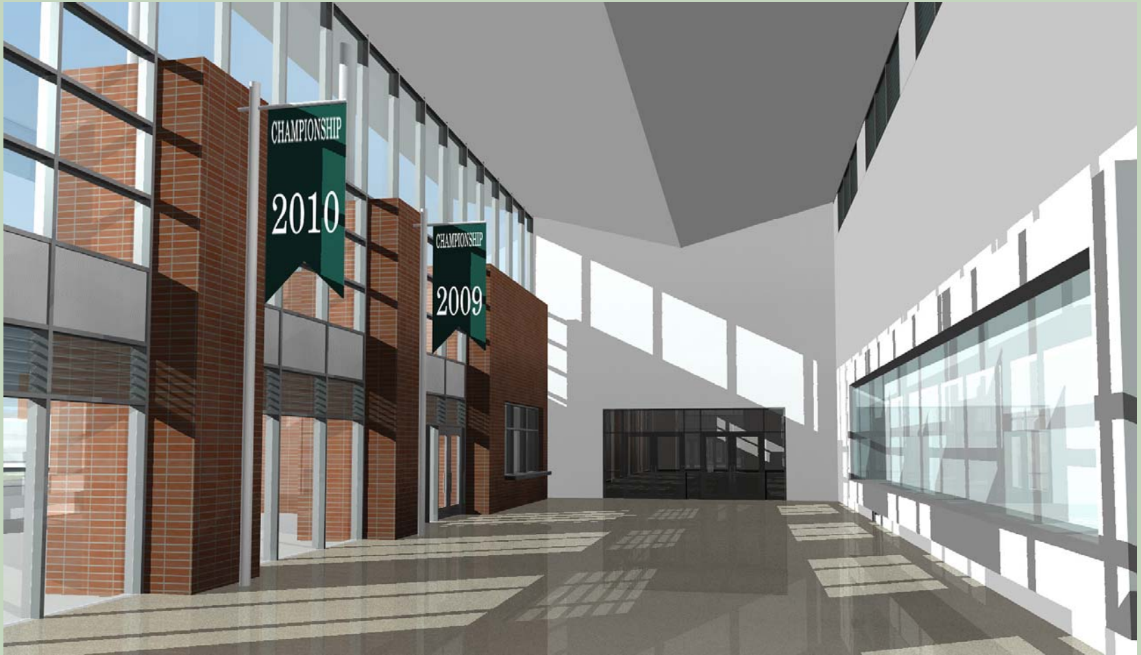
Interior Perspective View - Hall of Champions