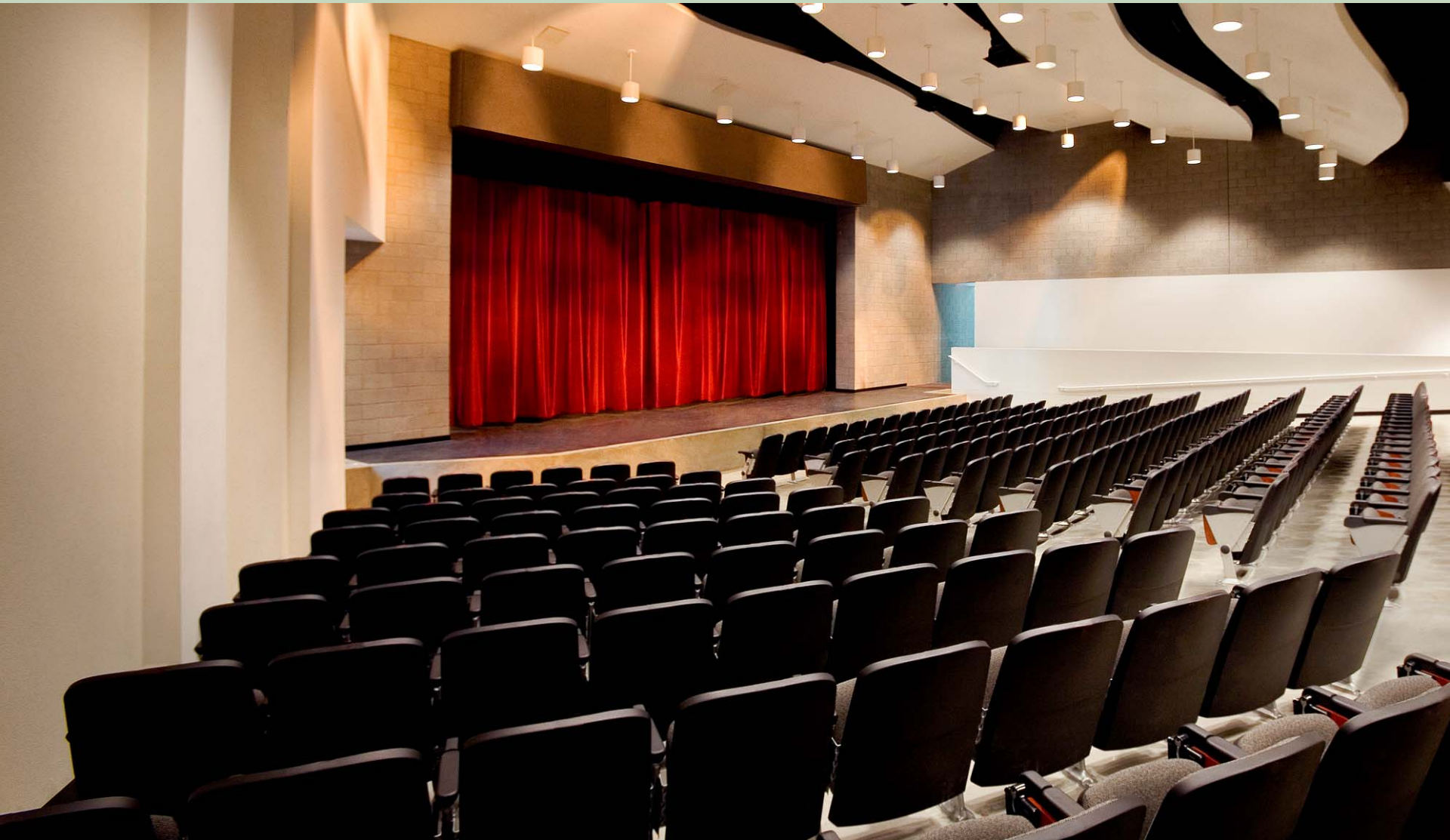
Interior Improvements Concept