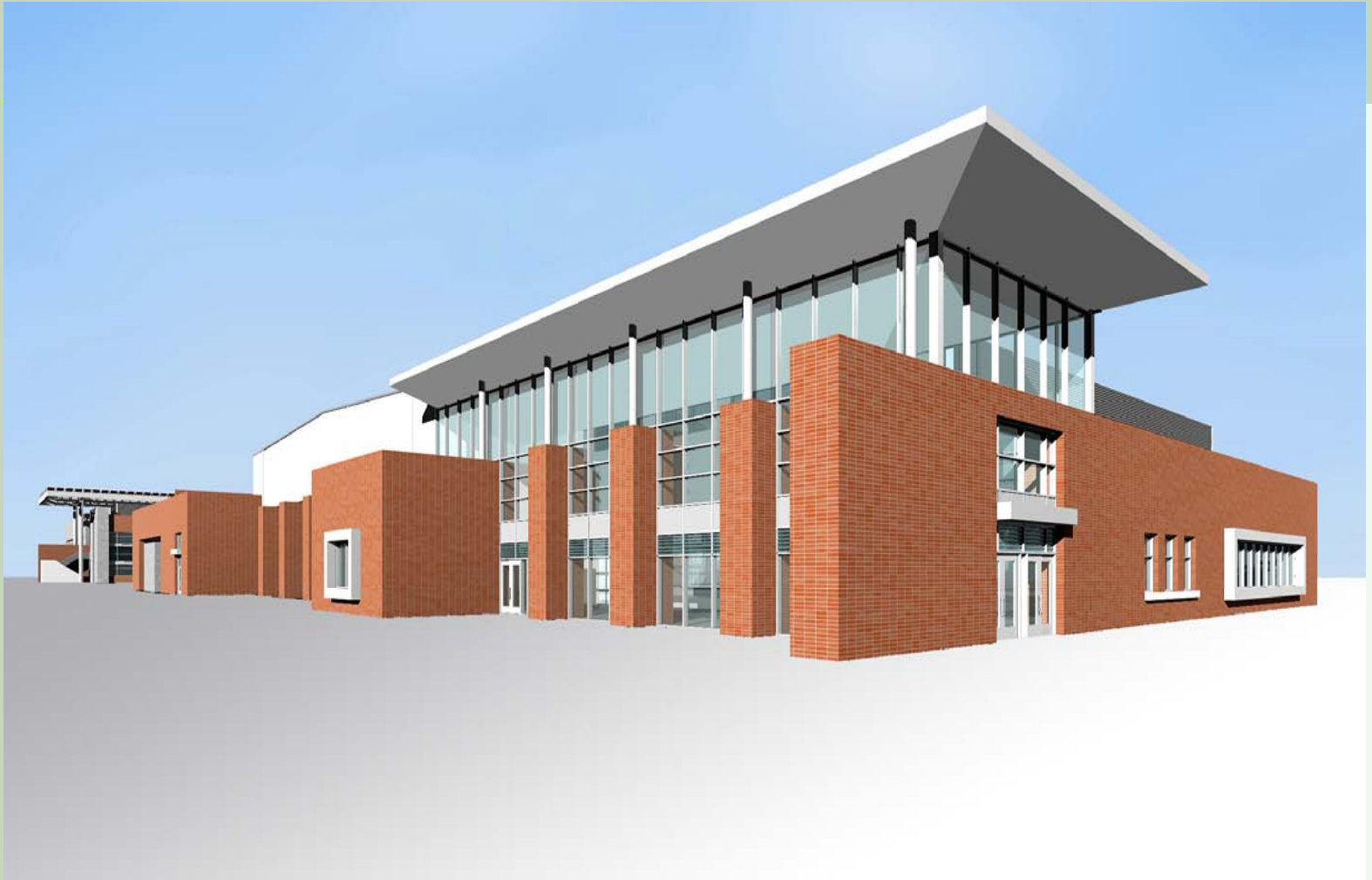
Perspective View of North-East Elevation