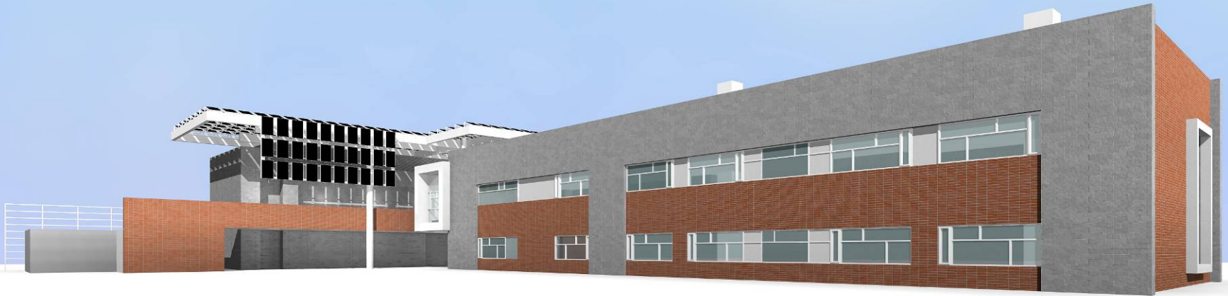
Perspective View of West Elevation